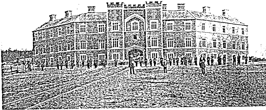
Pensioner Barracks & Parade, 1860s.